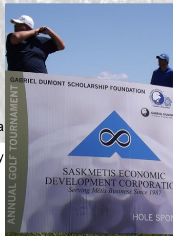
The 6 th Annual GDSF Golf Tournament will be held on May 26, 2017